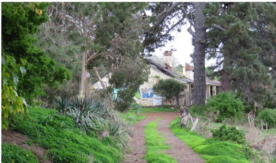
The Former Swan Inn & surrounds, Fyansford – a cultural heritage landscape (description next page)

HLCD has long and established relationships with many clients. Government clients include local Councils, State government and related entities like Working Heritage, and Commonwealth Departments, like the Department of Defence. We also provide expert architectural conservation advice to major Victorian developers including Glenvill, ICD Property and Stamoulis Group, as well as smaller scale investors, property owners and institutions. We collaborate with other award-winning architects on a variety of projects, including Six Degrees Architects, Kerstin Thompson Architects and MGS Architects. We regularly work with other consultants such as archaeologists, engineers, historians, quantity surveyors and archaeologists. We also have strong connections with builders and specialist heritage trades in Melbourne.