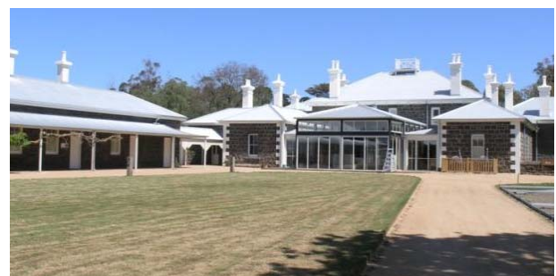
Eynesbury Station Redevelopment, winner of the Victorian Architecture Awards Heritage Category

Former Swan Inn and surrounds, Fyansford is a project where HLCD undertook a conservation management plan for the cultural heritage landscape, which includes an 1842 Inn and stables, a ford, bridges, important vegetation and archaeological relics. Following a fire at the site, we worked with structural engineers to stabilise the building and undertook stone repairs and re-roofing. All works were coordinated with archaeologists and subject to both Heritage Victoria permits and consents as a place of State significance. (Photo previous page).