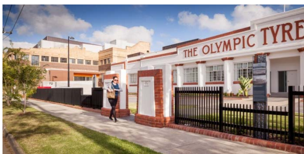
Banbury Village, Former Olympic Tyre Factory, UDIA award for medium density development

HLCD has provided a range of services over many years for complex sites. For the two award-winning projects illustrated, HLCD undertook the following services. Banbury Village : conservation management plan, part of redevelopment design team with MGS Architects reusing an industrial site as housing, heritage impact statements for local government permits, archival recordings and interpretation strategy. Eynesbury Station : conservation management plan, documentation of conservation works, heritage architecture for redevelopment of hotel complex, housing village and golf course, heritage impacts statements and facilitation of heritage permits from Heritage Victoria, archival recordings and interpretation strategy.